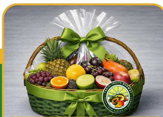
Special Occasion Fruit Box

A beautifully presented fruit box for partners and special clients. Carefully packed and delivered with quality and professionalism.