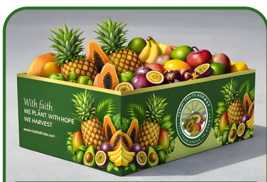
Fruit Sample Box – Business Edition

All boxes are prepared with care and delivered directly to your location.