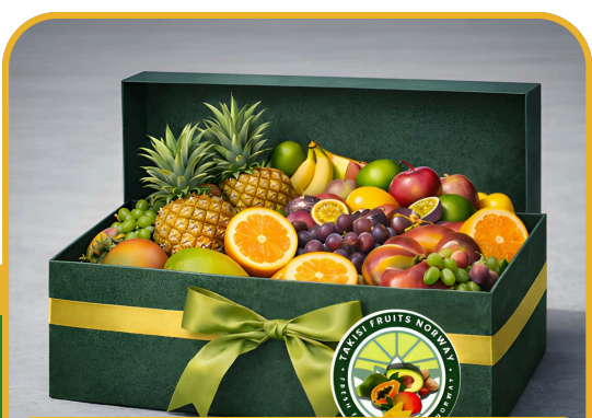
Premium Fruit Gift Box

A healthy and fresh fruit box for offices and teams. Perfect for regular supply — prepared and delivered directly to your business.