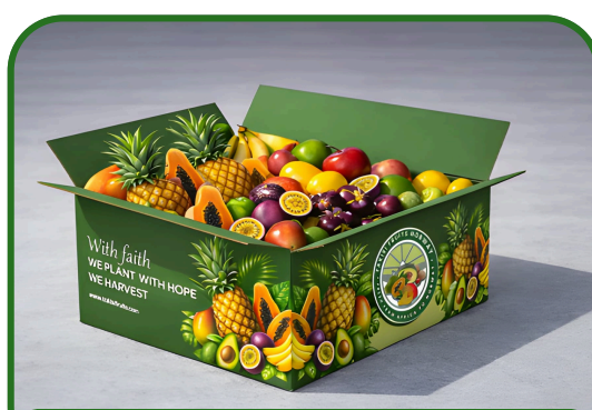
Office Fruit Box

A practical fruit box for companies who want to test our products. Fresh tropical fruits, professionally packed and delivered by Takisi Fruits Norway.